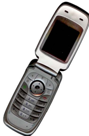
Fig. 3 Example of an image with acceptable resolution