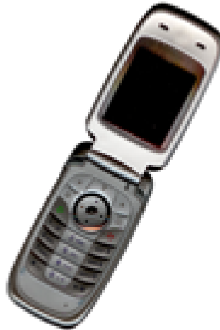
Fig. 2 Example of an unacceptable low-resolution image

Figures must be numbered using Arabic numerals. Figure captions must be in 8 pt Regular font. Captions of a single line (e.g. Fig. 2) must be centered whereas multi-line captions must be justified (e.g. Fig. 1). Captions with figure numbers must be placed after their associated figures, as shown in Fig. 1.